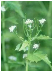
Mature plant, close-up