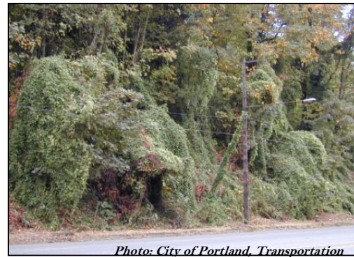
Portland roadside infested with noxious weeds