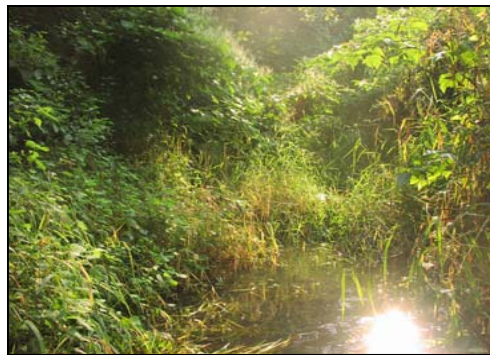
Japanese knotweed in McCarthy Creek

(National Invasive Species Management Plan)