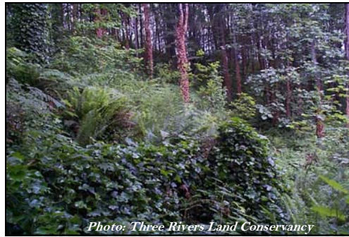
English ivy along a SW Portland roadside

A species that is non-native to the ecosystem and whose introduction adversely affects the economy, the environment and human health.